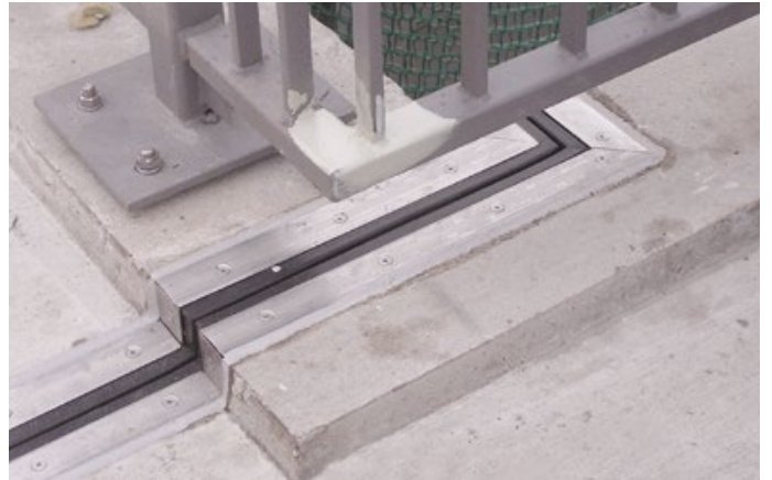
Eilenburg bridge renovation