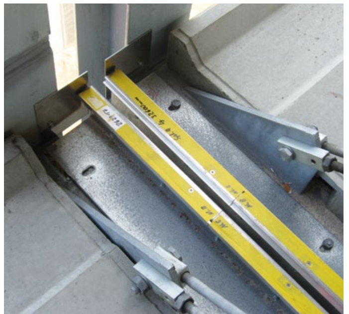
Parking deck Weiterstadt –FP 90