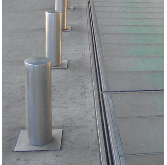
Cologne/Bonn airport – FP 90