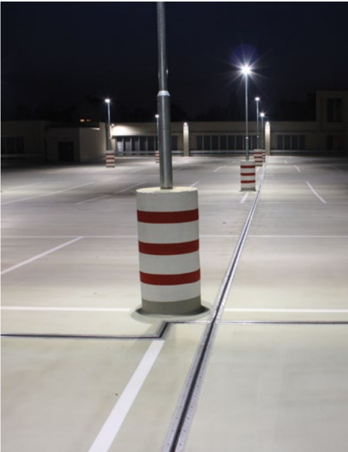
Parking deck of shopping centre Dresden, Löbtau