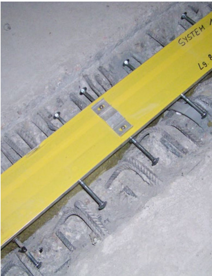
Airport Berlin – FP 90 BNI