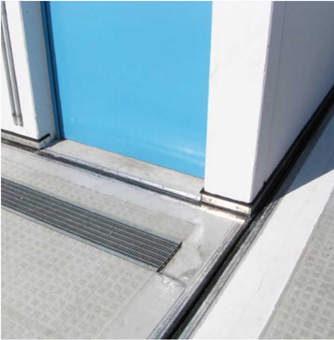
Parking deck Berlin, Beusselstrasse