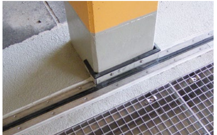
Parking deck Annaberg – FP 90