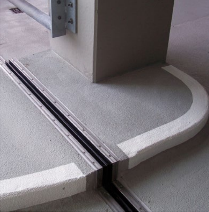
Nuremberg airport – FP 90; FP 115